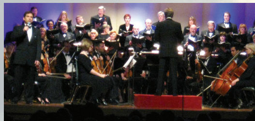
The Lawton Philharmonic Chorus