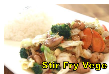
Stir Fry Vege