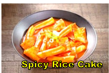
Spicy Rice Cake