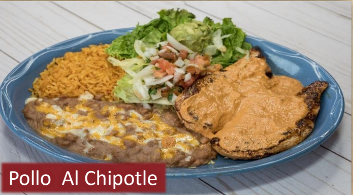
Pollo Al Chipotle