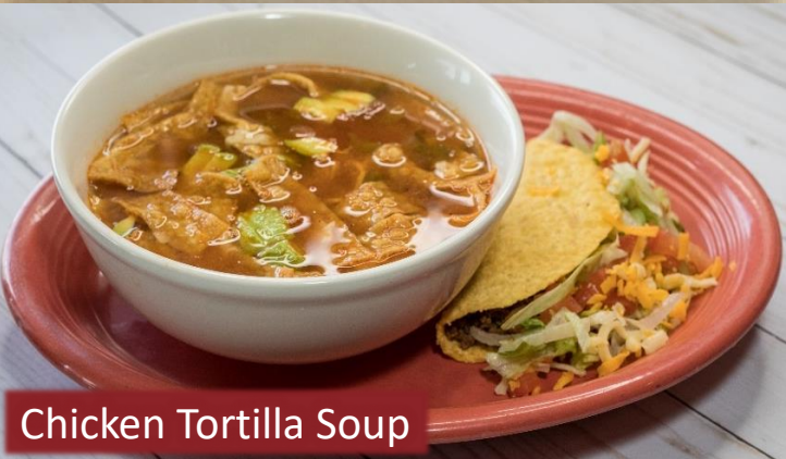
Chicken Tortilla Soup