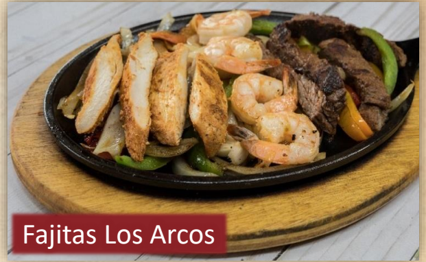
Fajitas Los Arcos