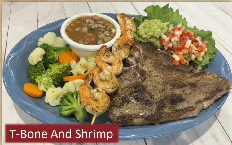
T-Bone And Shrimp