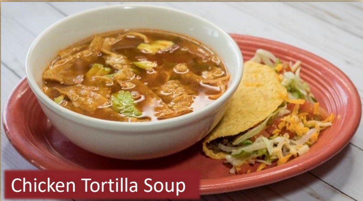
Chicken Tortilla Soup