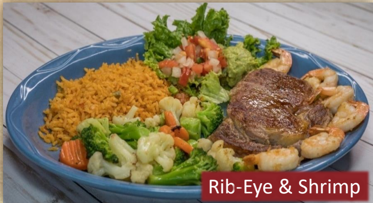
Rib-Eye & Shrimp