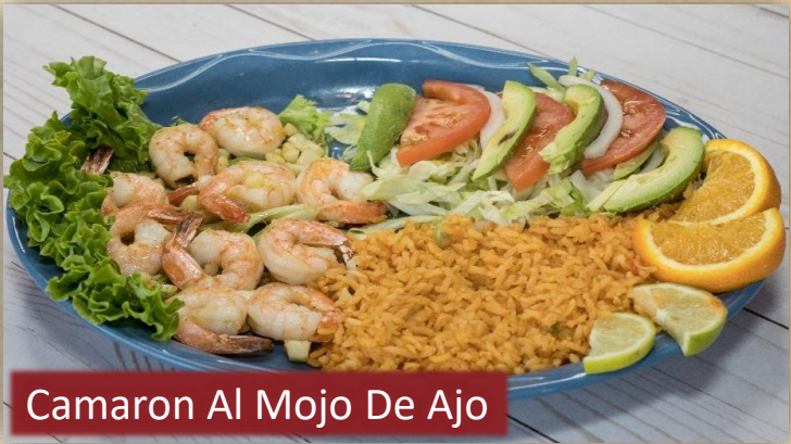
Camaron Al Mojo De Ajo