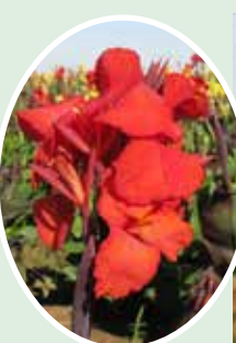
Cleopatra New for 2018! Dustin's favorite variety! Red randomly marks both the bloom and foliage in fun and unexpected ways. No two plants are alike. $9.00 each