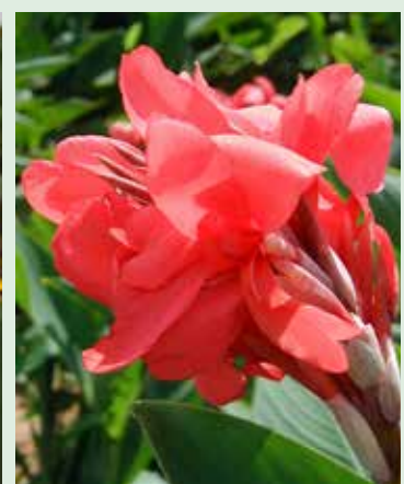
Crimson Beauty Red and pink fused together for a fabulous shade of red, complemented by shiny green leaves. $3.00 each