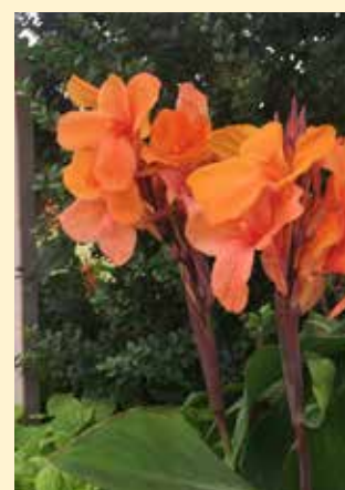
Tangelo Hues of tangerine orange warm flowerbeds as the perfect accent color for cannas, other perennials and annuals. $5.00 each