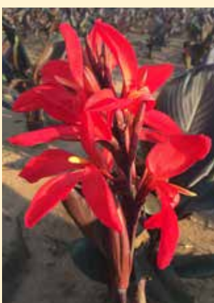
Red Futurity Chocolate foliage and crimson blooms shine outside our kitchen window. A farm favorite that stays petite and is self-cleaning! $7.00 each