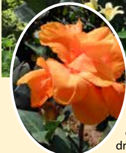
Wyoming This award winner brings impact to the garden! Orange blooms contrast against bronze foliage in a dramatic combination. $3.00 each