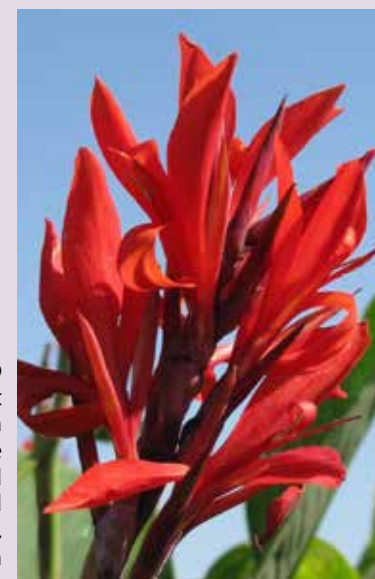
Robert Kemp Feathery, upright red blooms and a mass of green foliage create a splendid hummingbird playground. $5.00 each