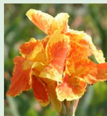
Yellow King Humbert This unique and vintage variety has bicolor blooms of buttery yellow splashed with orange. A gardening favorite for over 125 years. $3.00 each