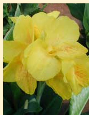
King City Gold Loaded with cheery yellow blooms accented by dark green foliage. Look closely for soft red dotting across the petals. $3.00