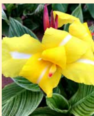
Striped Beauty Unique striped foliage, red buds that open to yellow blooms marked by a white cross. Stunning planted in front of Australia or Red Futurity. Self-cleaning. $7.00 each