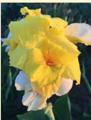
Carol's Yellow New & Exclusive for 2018! Shades of cream, pastel yellow and lemon brushed with a few salmon speckles all on one bloom. $5.00 each