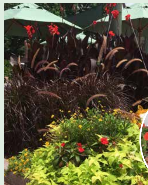
Australia Dark chocolate foliage topped with ruby red blooms grow from a surprisingly small bulb. Stunning in contrast to green foliage plants. $7.00 each