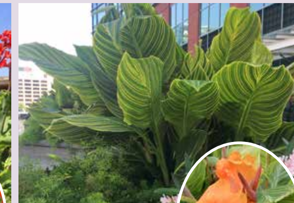
Pretoria Purplish-red stems that reach up from the wildly marked stripy foliage giving way to massive orange blooms. Also known as Bengal Tiger. $9.00 each