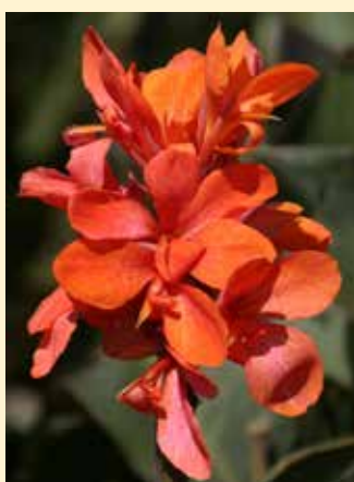
Burning Ember Petite but powerful! Fiery orange blooms glow amidst dark bronze foliage. One of the shortest of our dwarf varieties. $5.00 each