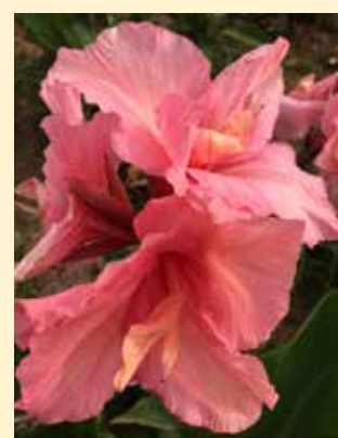
Chinese Coral Chinese Coral is the perfect baby pink canna. It multiplies very slowly making this variety a rare gem among cannas. $9.00 each