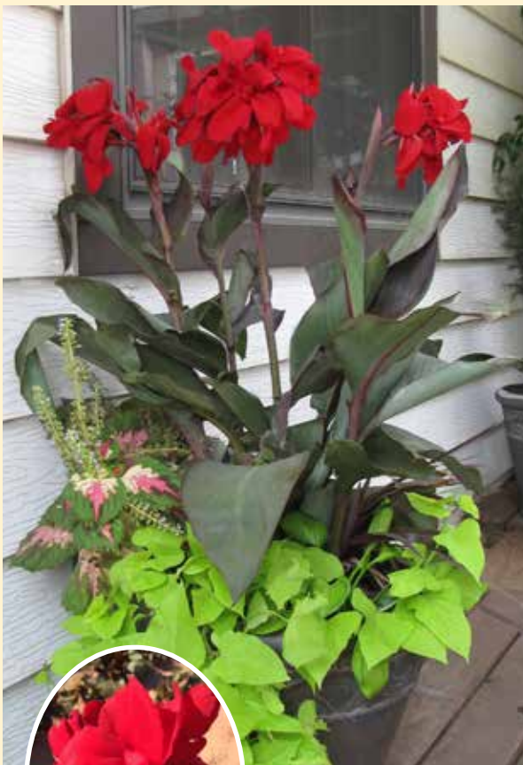
Black Knight New for 2018! Black Knight's irresistible velvety red blooms are unlike any other canna. Limited availability means it will sell out early. $9.00 each