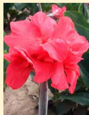
Scarlet Wave Huge, cherry red blooms adored by gardeners and hummingbirds alike! Especially showy planted in front of Richard Wallace. $7.00 each