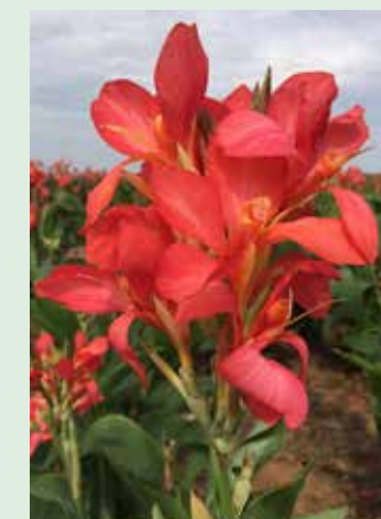
City of Portland This popular and well-known canna produces coral pink blooms and lush, tropical green foliage. $3.00 each