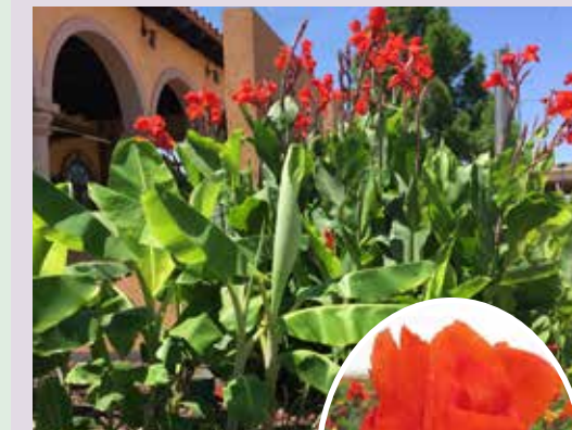
Red Dazzler Bright red blooms blaze above green foliage. Red Dazzler is statuesque planted in a grouping or along a fence. $3.00 each