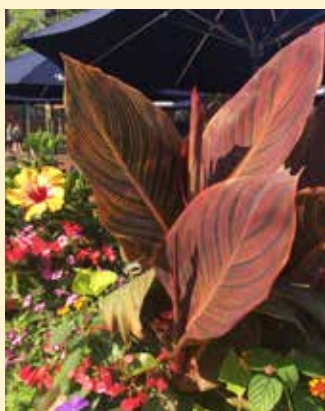
Durban New for 2018! Psychedelic leaves and orange blooms are like no other! Originating from Durban, South Africa. Also known as Phasion. $9.00 each