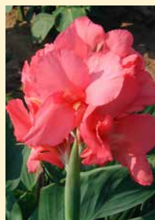
Maudie Malcolm Rich pink blooms delight with their ruffled edges. Look closely for a hint of white peaking from the center. Self-cleaning. $9.00 each