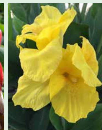
Richard Wallace Typical iris-like lemon drop yellow blooms mixed with the perfect hint of green apple foliage. $5.00 each