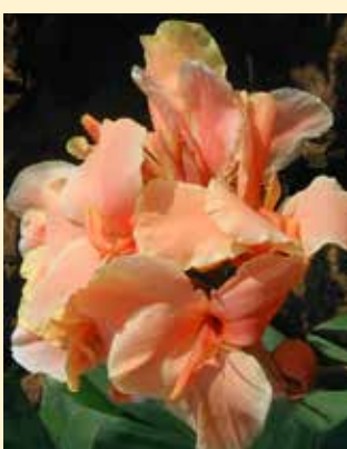
Tropical Sunrise Blushing apricot blooms mingled with soft coral create a tropical vibe in the garden. Contrasts beautifully with orange and pink cannas. $5.00 each