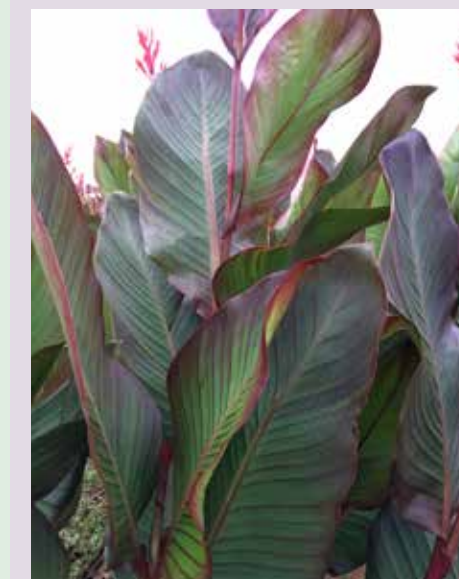
Musifolia Dramatic foliage towers above the garden with late season blooms. Bronze trimmed foliage explodes in the evening sun. Giant height of six feet or more. Produces massive rhizomes. $5.00 each