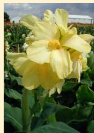
Yellow Futurity Pastel yellow blooms pack an unsuspecting punch when planted individually and even more so in groupings. Self-cleaning. $3.00 each