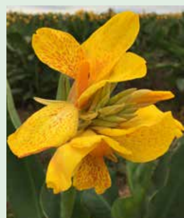
Golden Lucifer Golden blooms dazzle both at a distance and up close with red speckles that dance across the petals. $5.00 each