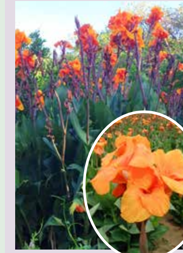
Orange Beauty This classic tall variety paints a gorgeous backdrop in the garden for dwarf and medium height cannas. $3.00 each