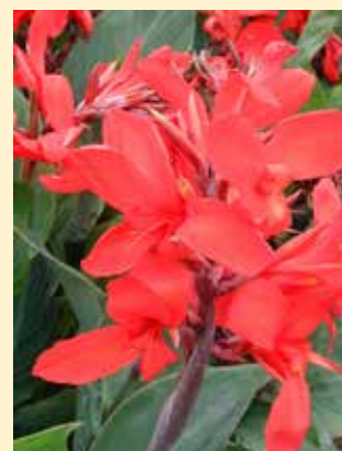
Firebird Grandmother Louise Horn's favorite variety. Crimson red blooms create an image of birds ready for flight. $3.00 each