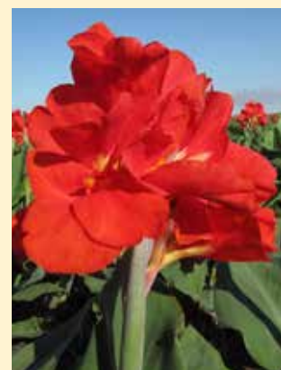
President Our most popular variety! Massive blooms cause quite a stir, causing neighbors to stop and inquire about this unbeatable variety. $5.00 each