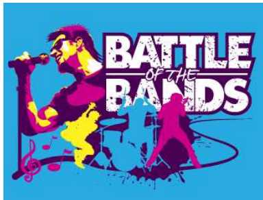
Battle of the Bands Thursday, June 1 st @ 7:00PM

The Diamond Daze Festival will take place June 1 st , 2 nd and 3 rd on the Sallisaw High School Campus. There will be a high steaks grilling contest, 5K Run, arts & crafts, pony rides, helicopter rides, car show, games & rides on the carnival midway and entertainment nightly on the Diamond Daze Stage! There is something for everyone at Diamond Daze 2017!