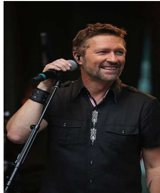
Craig Morgan Friday, June 2 nd @ 7:30PM