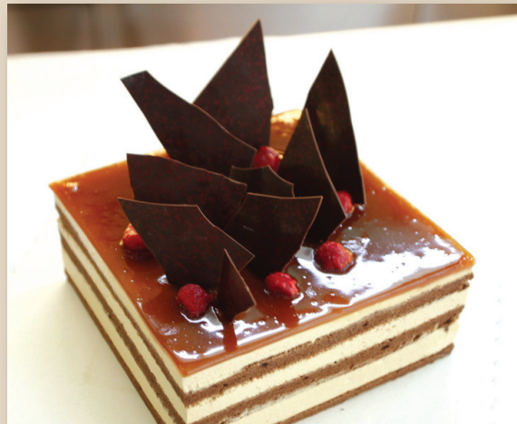
Mocha Mousse Cake