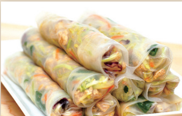
Shrimp Spring Rolls