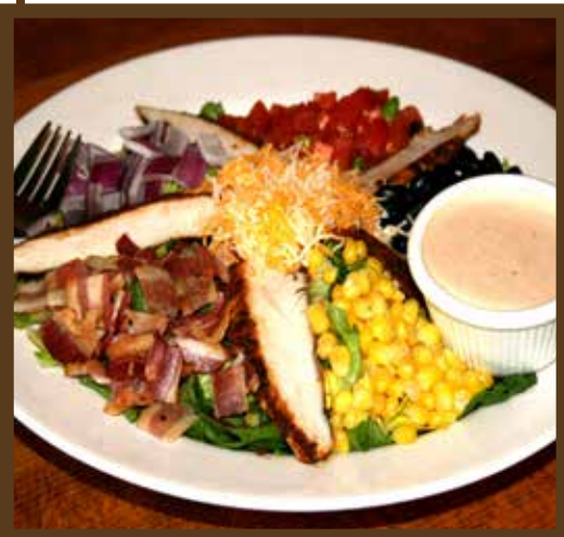
SOUTHWEST BLACKENED CHICKEN SALAD

All salads are served with your choice of dressing: Ranch, Italian, Honey Mustard, Balsamic Vinegar, Strawberry Vinaigrette, Bleu Cheese, Oil & Vinegar, Thousand Island, Light Ranch or Light Italian.