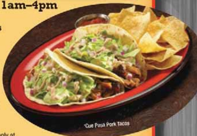
'Cue Pasa Pork Tacos

Two downsized sandwiches, each with your choice of our matchless meats. Comes with one side of your choice. 6.49