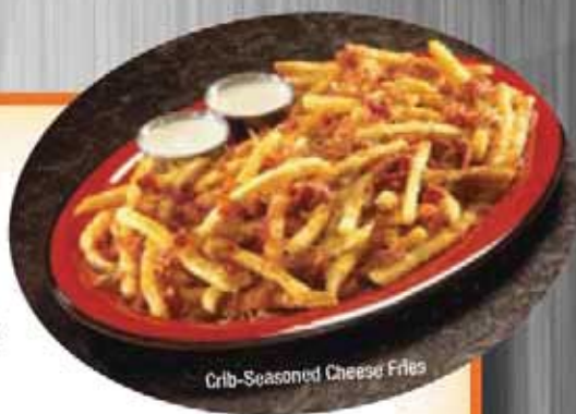
Crib-Seasoned Cheese Fries

Lightly breaded mozzarella cheese and fried mushrooms served on a bed of fries, all ready for a dip in zesty marinara sauce and Ranch dressing. 6.49