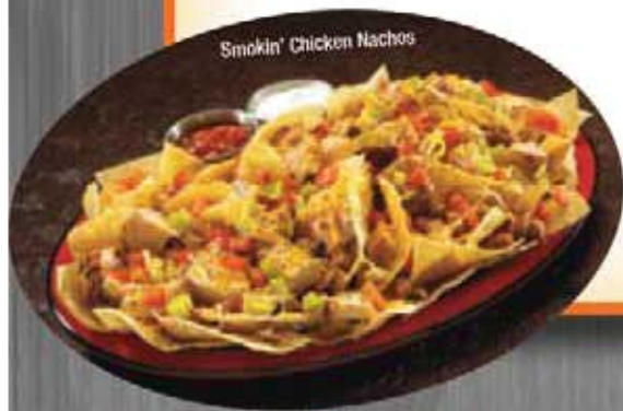
Smokin' Chicken Nachos

Served with your choice of sassy sauces: honey barbecue or our original hot wing sauce, if you're up to it One dozen 6.99 Two dozen 11.99 Each additional dozen 5.00