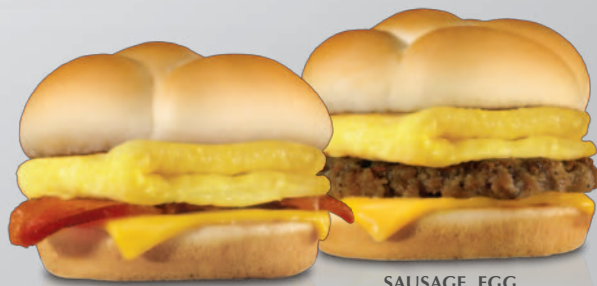
BACON, EGG & CHEESE MINI

Two mini buns with scrambled egg, cheese, and thick hickory-smoked bacon or sausage. 1.99 One Mini, .99